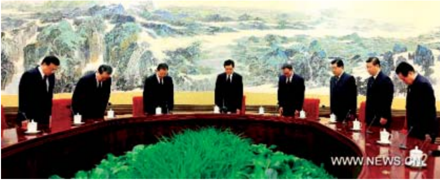
Amid sirens and blaring horns, people across China Sunday stood in tribute to victims of a massive mudslide in a remote northwest town.

the debris, searching for bodies and spraying disinfectant in the area. Some survivors sat silently on the debris, still holding out hope that the