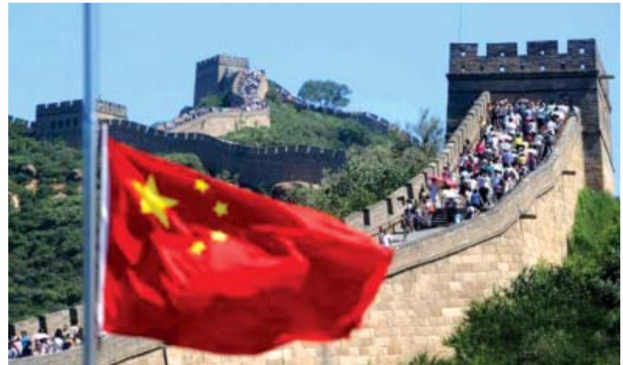
According to Chinese tradition, the seventh day after a death marks the height of the mourning period. Large-scale national displays of mourning are rare in China.

In central Beijing, thousands of people gathered at the Tian'anmen Square early Sunday to watch the national flag hoisted to full height and