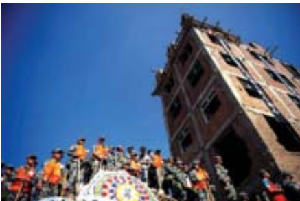
Chinese leaders, students, workers and members of the public paused for three minutes from 10 a.m. Sunday, a week after the devastating mudslide hit Zhouqu County, in Gannan Tibetan Autonomous Prefecture of Gansu Province.

Overseas Chinese in Cambodia have called the Chinese embassy to express condolences, saying they are